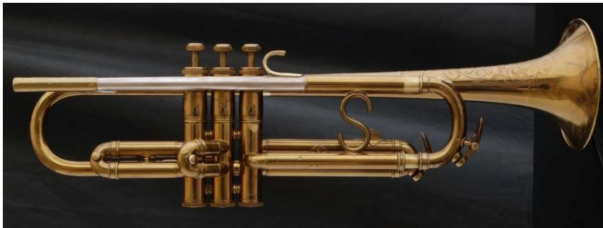
London Selmer Cadet made in West Germany